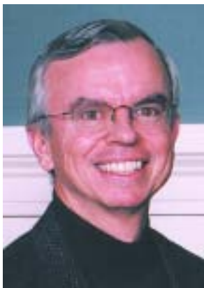
By Terry Moore

Excuse me while I clean out my desk er...mind. A proverbial pack-rat, I've been saving up notes and brochures for the past few months waiting for the "write" opportunity. So with that as fair warning, here we go.