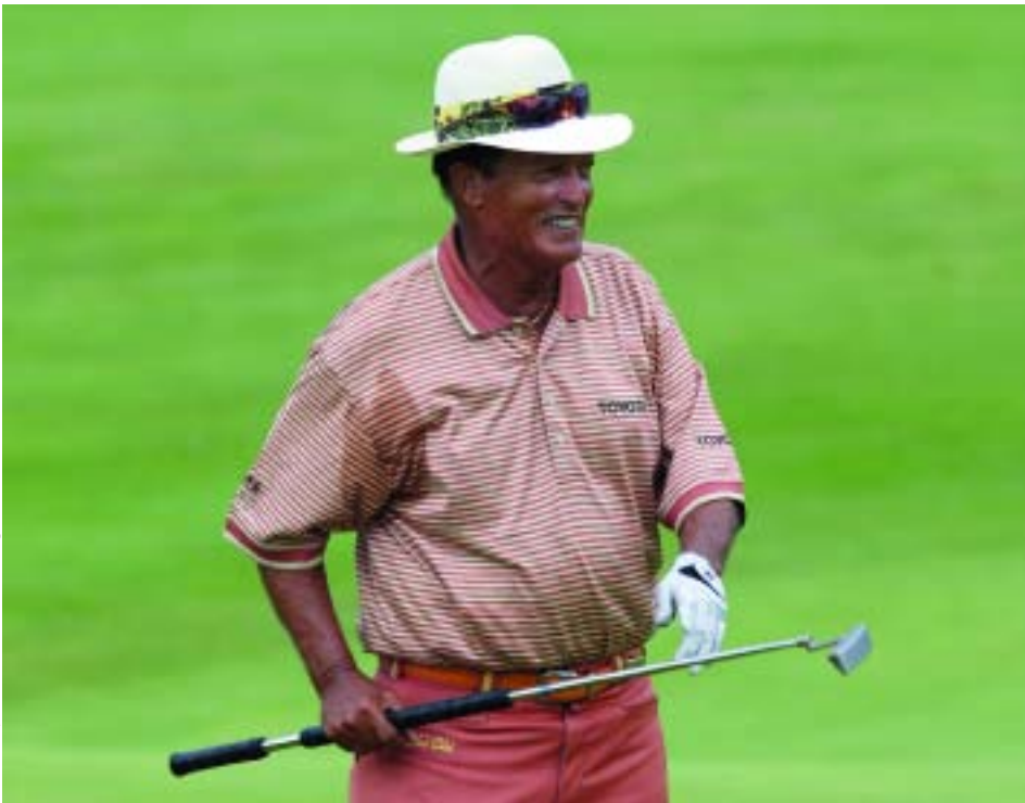
Chi Chi Rodriguez plays in the TPC at Dearborn